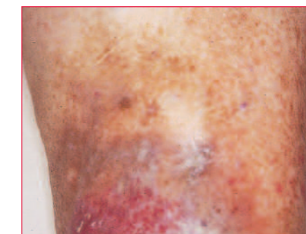
Healed Venous Leg Ulcer or Skin at Risk

A healed wound is epithelialized with adequate strength to maintain closure. Skin at risk is tissue exposed to potential injury or tissue that is in a weakened condition (e.g. dry, thin).